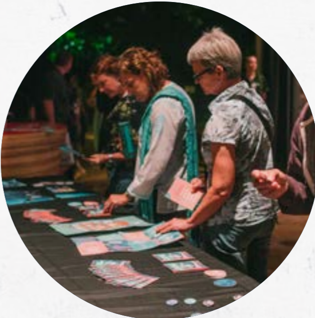
Opening & Closing Events