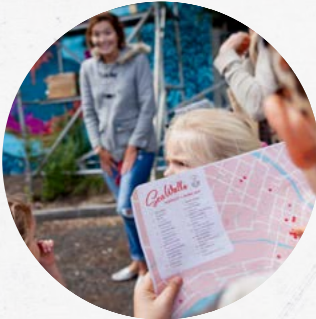
Mural Viewing Tours