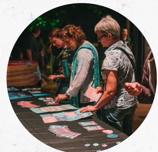
Opening & Closing Events