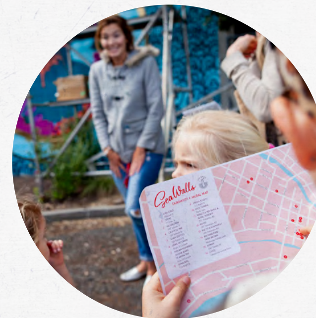
Mural Viewing Tours