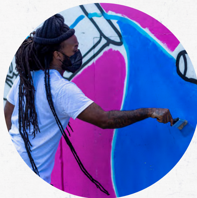
Live Mural Painting

In addition to the curation of purposeful, ocean-themed public art, Sea Walls St.Thomas aims to incorporate a whole host of side events, including the public project launch during Reefest. From youth activities and film screenings to mural tours and panel discussions, the week-long program is only the beginning of the benefits of SeaWalls to the community.