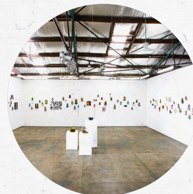
Outdoor Art Show