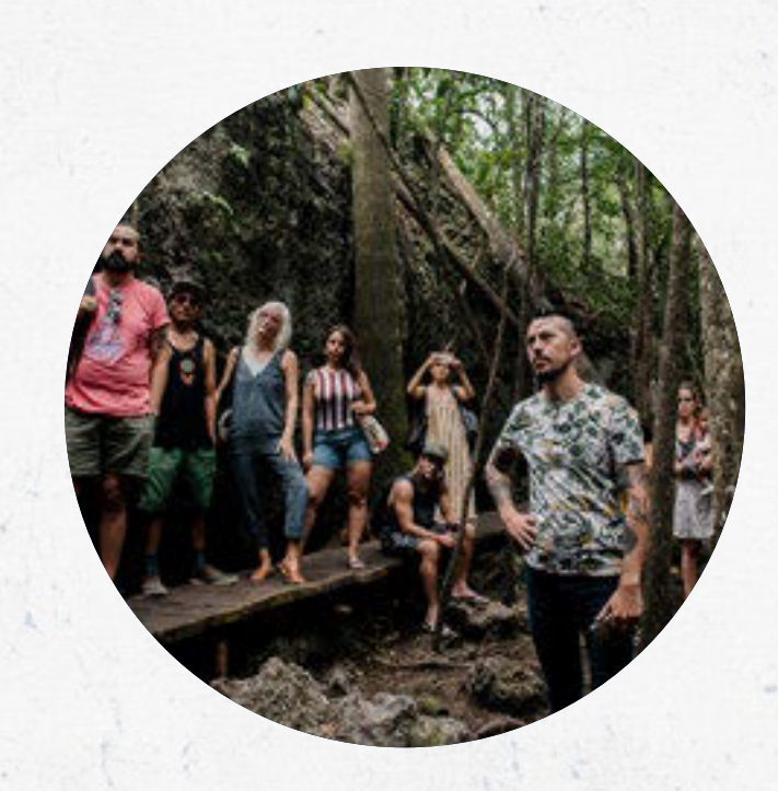
Cultural and Environmental Excursions