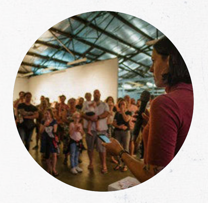
SWBOS Kickoff: Opening Ceremony

Beyond the curation of purposeful, ocean-themed environmental public art, Sea Walls Boston aims to incorporate a whole host of side events, making it a holistic festival for all ages. From youth outreach activities and film screenings, to mural tours and panel discussions, the week-long programming will provide plenty of opportunities for the community to get involved and experience valuable interactions with your brand.