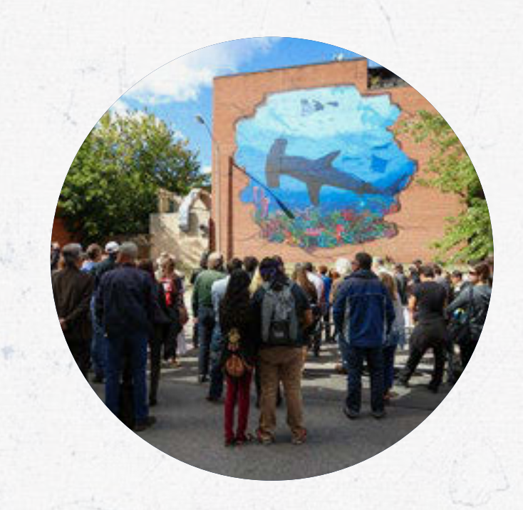
MURAL VIEWING TOURS: Walking/Biking tours