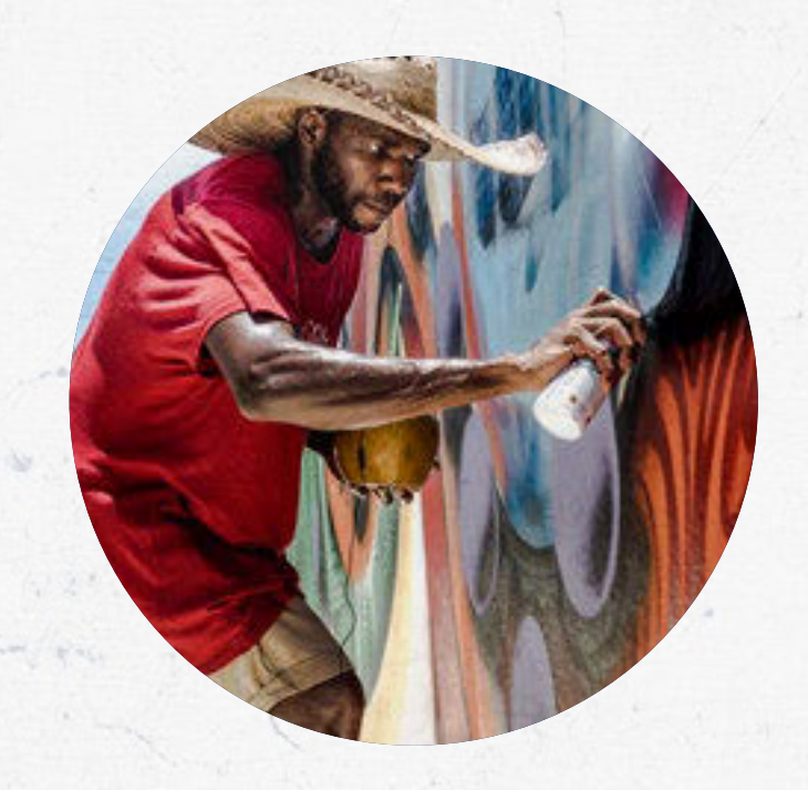
MURAL PAINTING: 15 Large-Scale Murals