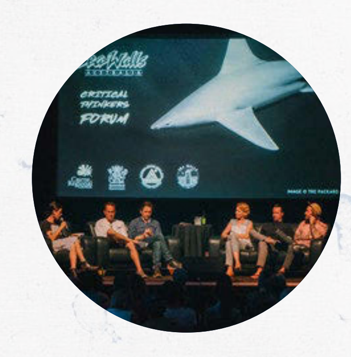
Artist Panel Discussions